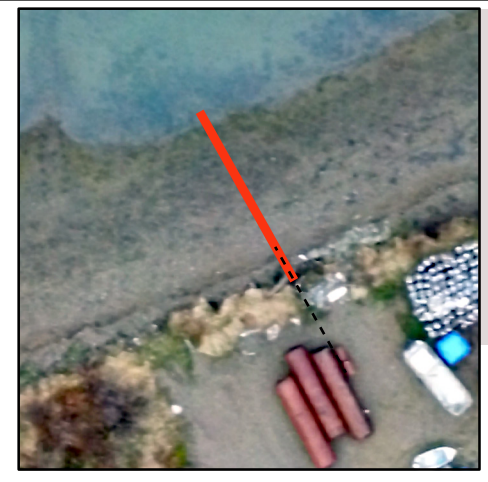
Profile 8 Bearing: 320°

Starting object: large driftwood in bluff