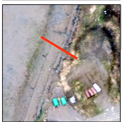
Profile 5 Bearing: 290°